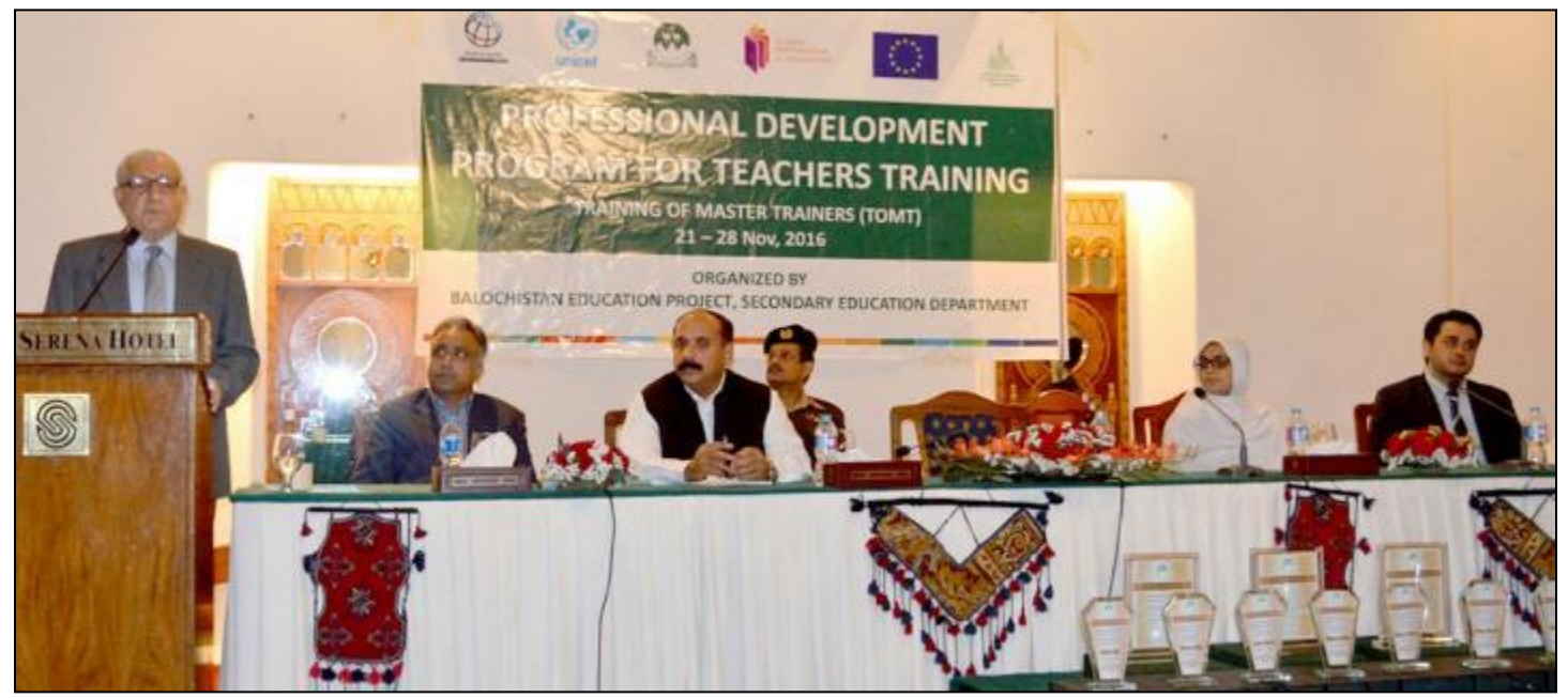
Governor Balochistan, Mohammad Khan Achakzai addressing the closing ceremony of ToMT